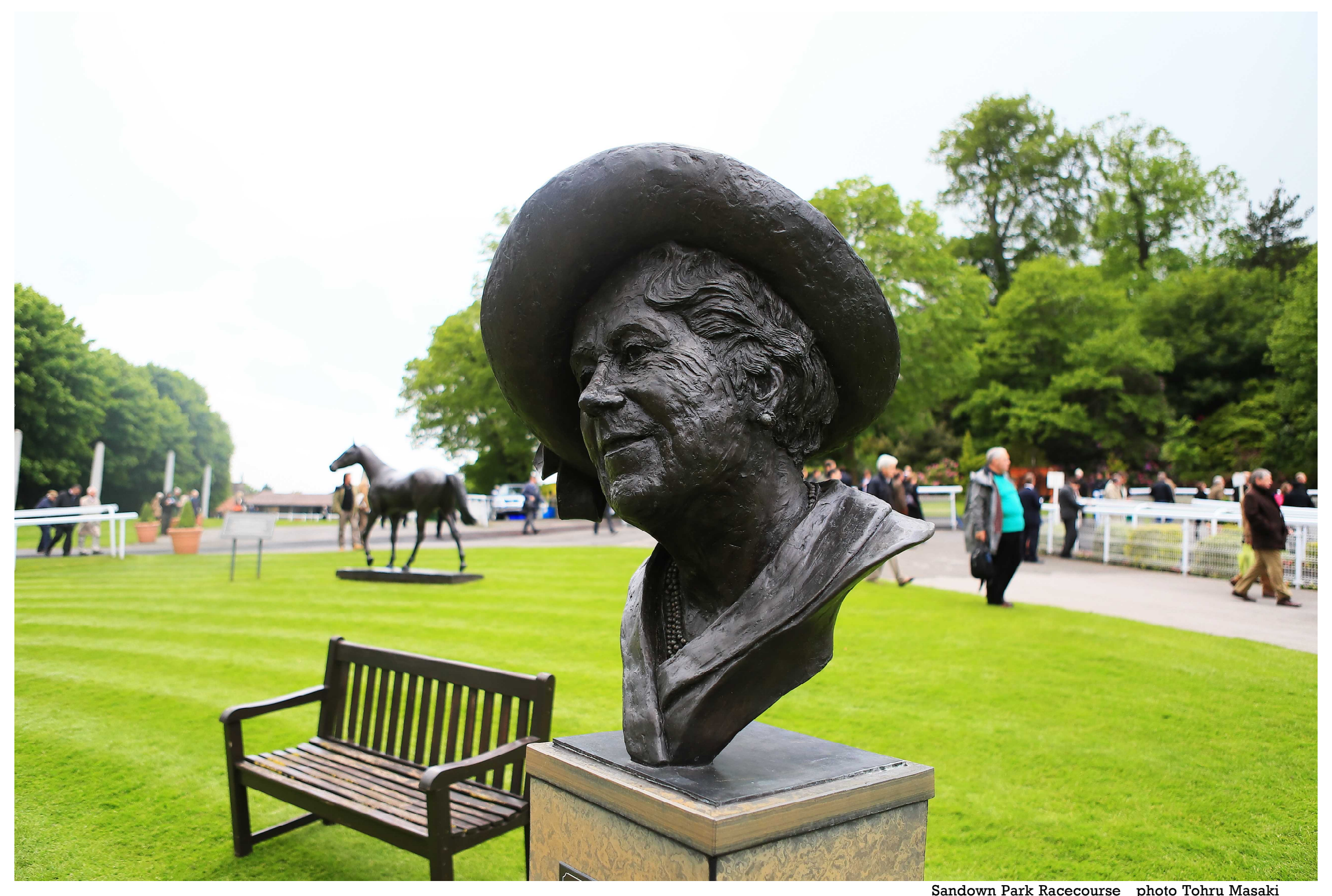
Sandown Park Racecourse